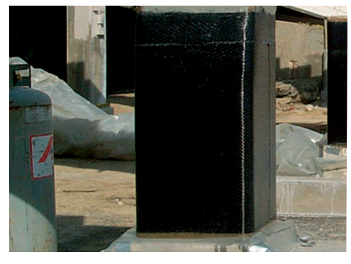
Columns Strengthening (Confinement)