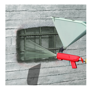
Step 4: Application of Concrete protection Solution Sikagard® XT/ Sikagard® 550 W Elastic/ Sikagard® PU UR