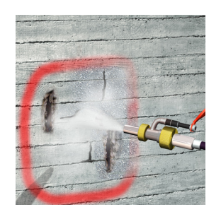
Step 1: Removal of Damage Concrete