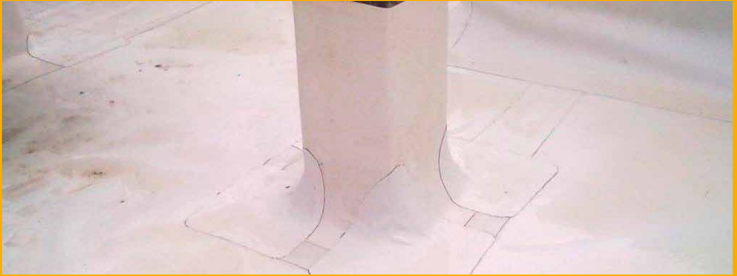
Sika Sarnafil System at Bayer Bio Science, Hyderabad